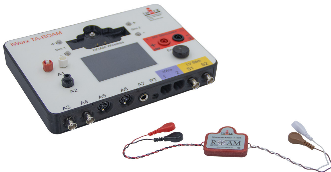
Figure HM-3-S1: The EOG cable connected to an IXTA.