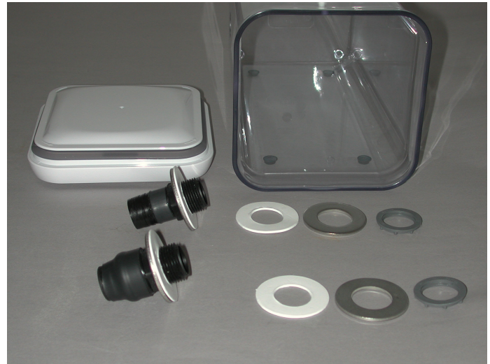
3: Metal and Plastic washer on port

2) Place the metal washer and then a plastic washer on each port. Insert it through the hole in the chamber wall and place the plastic washer, then the metal washer and then the nut, from the inside. Hand Tighten, both ports.