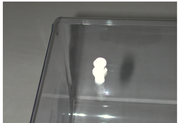
1: Luer Connectors

1) Screw the Luer Connectors to the top of the chamber.