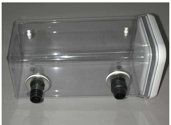
5: Assembled Chamber.